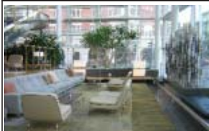
Hilton Hotel in Malmö

Hilton Malmö City Triangeln 2 Malmö, Sweden 20010 Phone: +46-40-6934700 Fax: +46-40-6934711 E-mail: malmö-city@hilton.com www.hilton.com To receive the conference rate for the hotel, you must use the following code: LTH240506