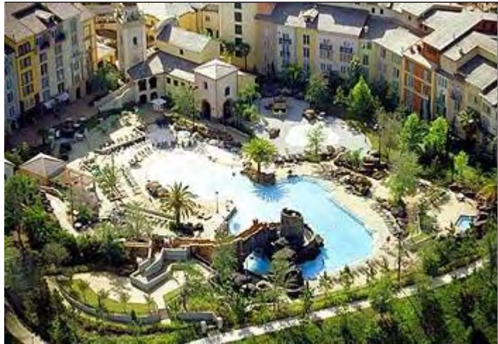
Universal's Portofino Bay Hotel