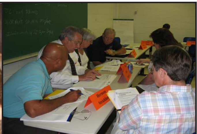
SI Workshop Participants

For possible inclusion in an upcoming newsletter, you are invited to send your "Best Practice" (250 words) to Kim Wilcox (wilcoxk@umkc.edu).